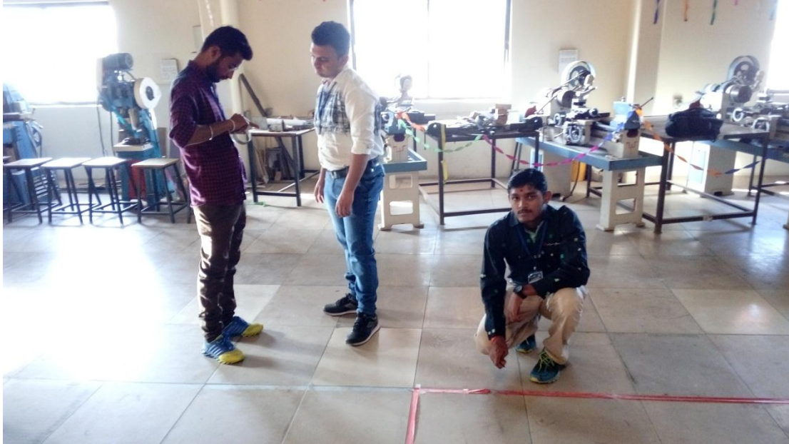
Photo of preparation